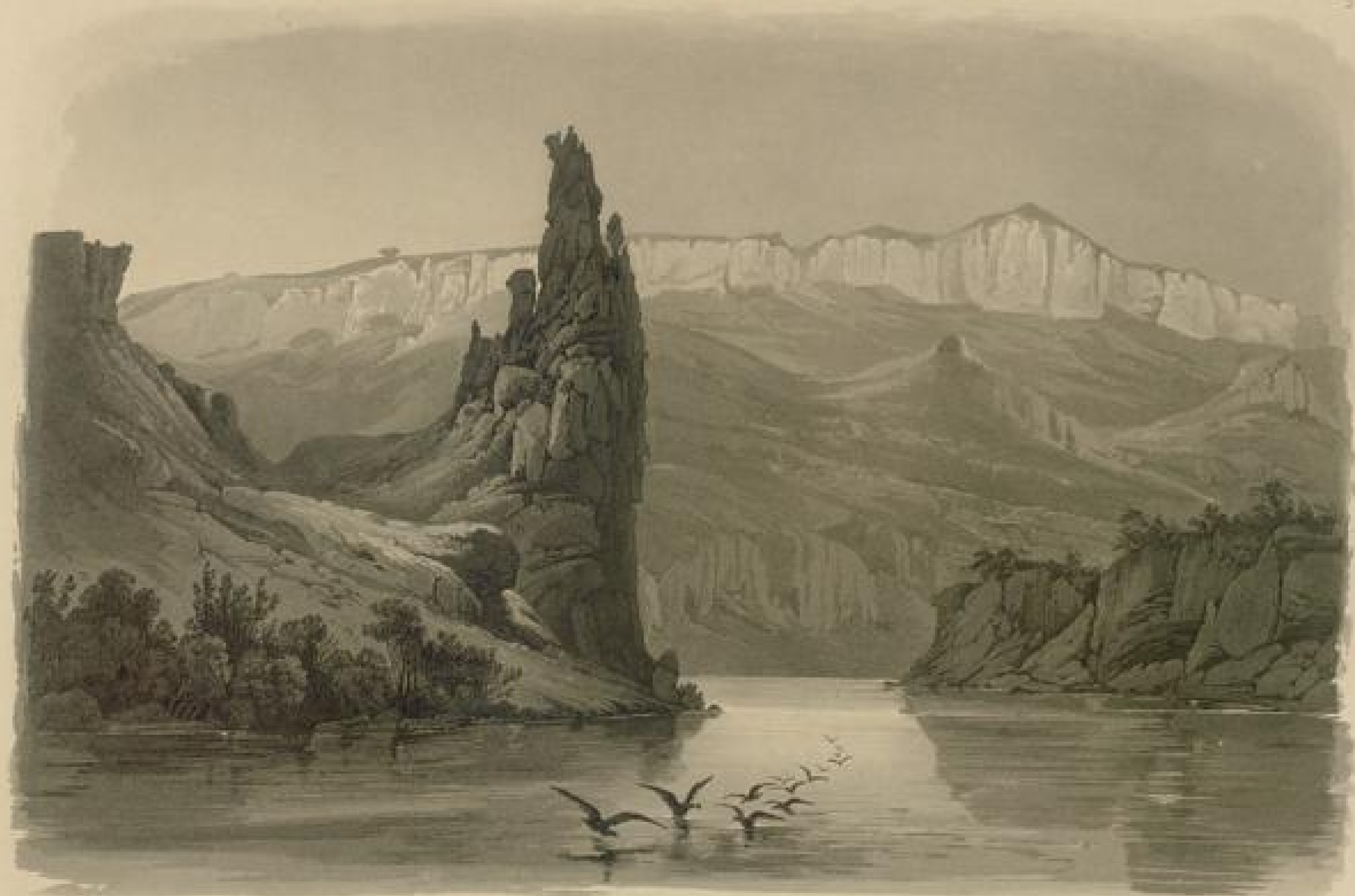
FELSEN GENANT DIE CITADELLE sur le rivage de Messine.