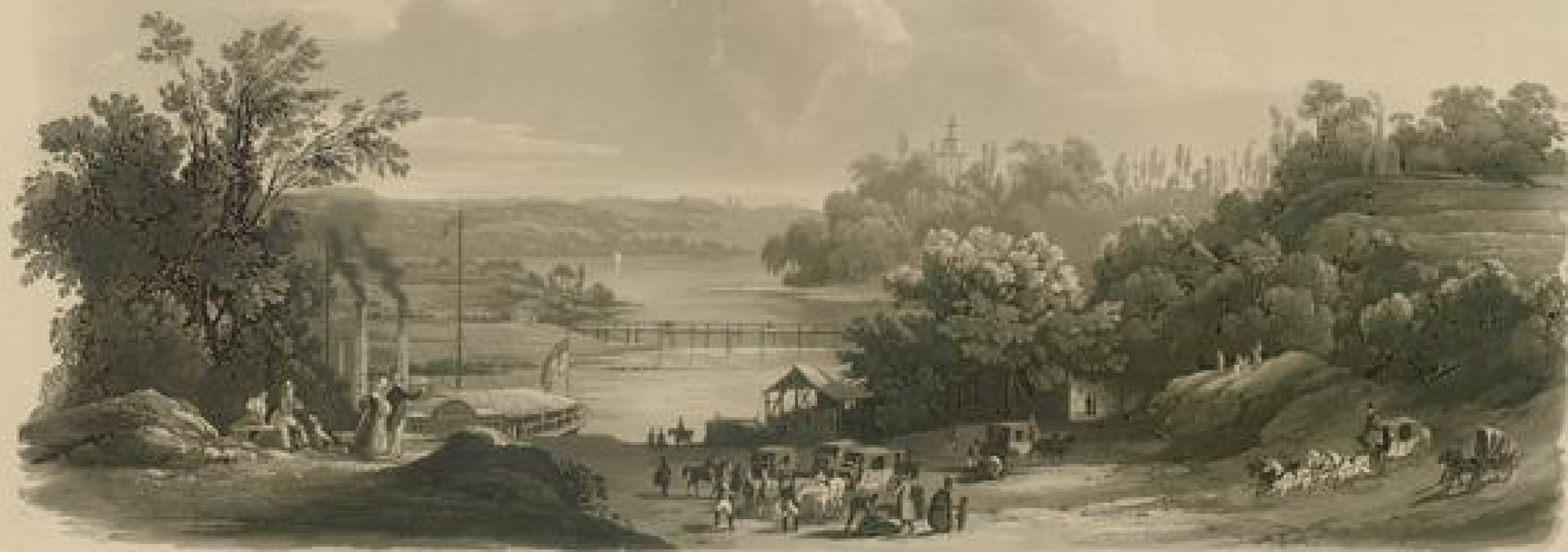
AUSSICHT AUF DEN DELAWARE