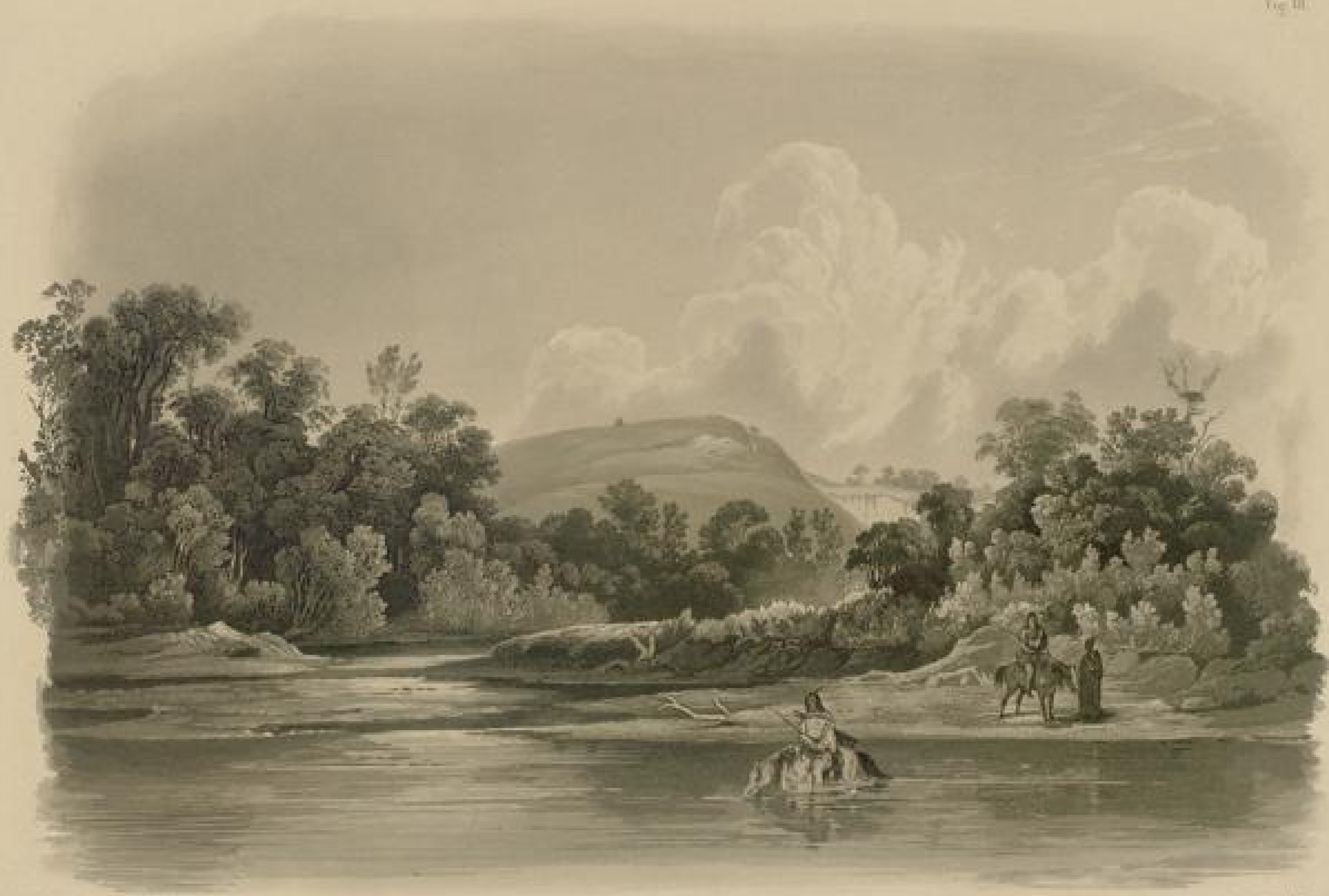
WACHUNGA LAINA'S GRAF

auf der Blaufluth's Flugschiff (W. P. de L. de L.)