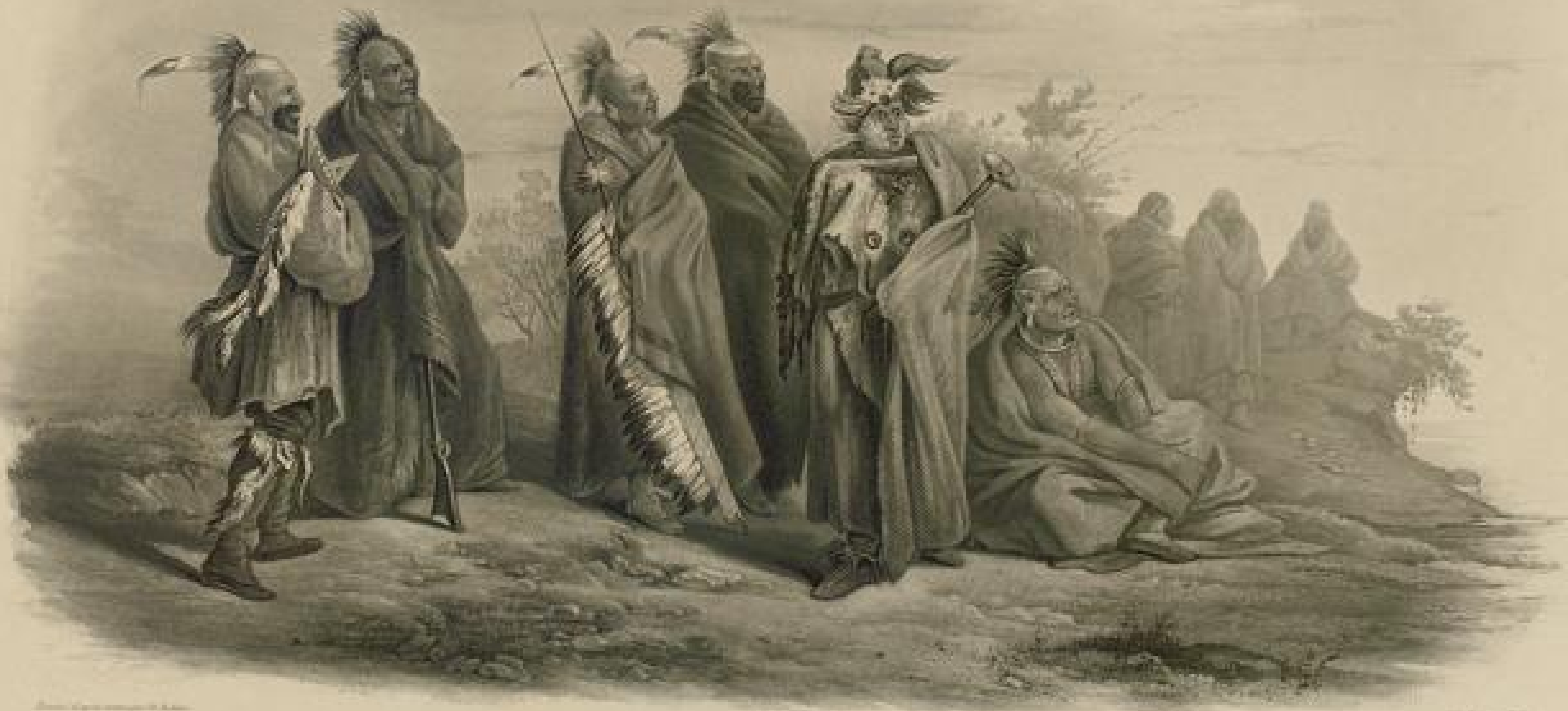
SARKI UND BUSQUAKE INDIANER. | INDIENS SÂRIS ET BERNARDS. SAUKIE AND FOX INDIANS