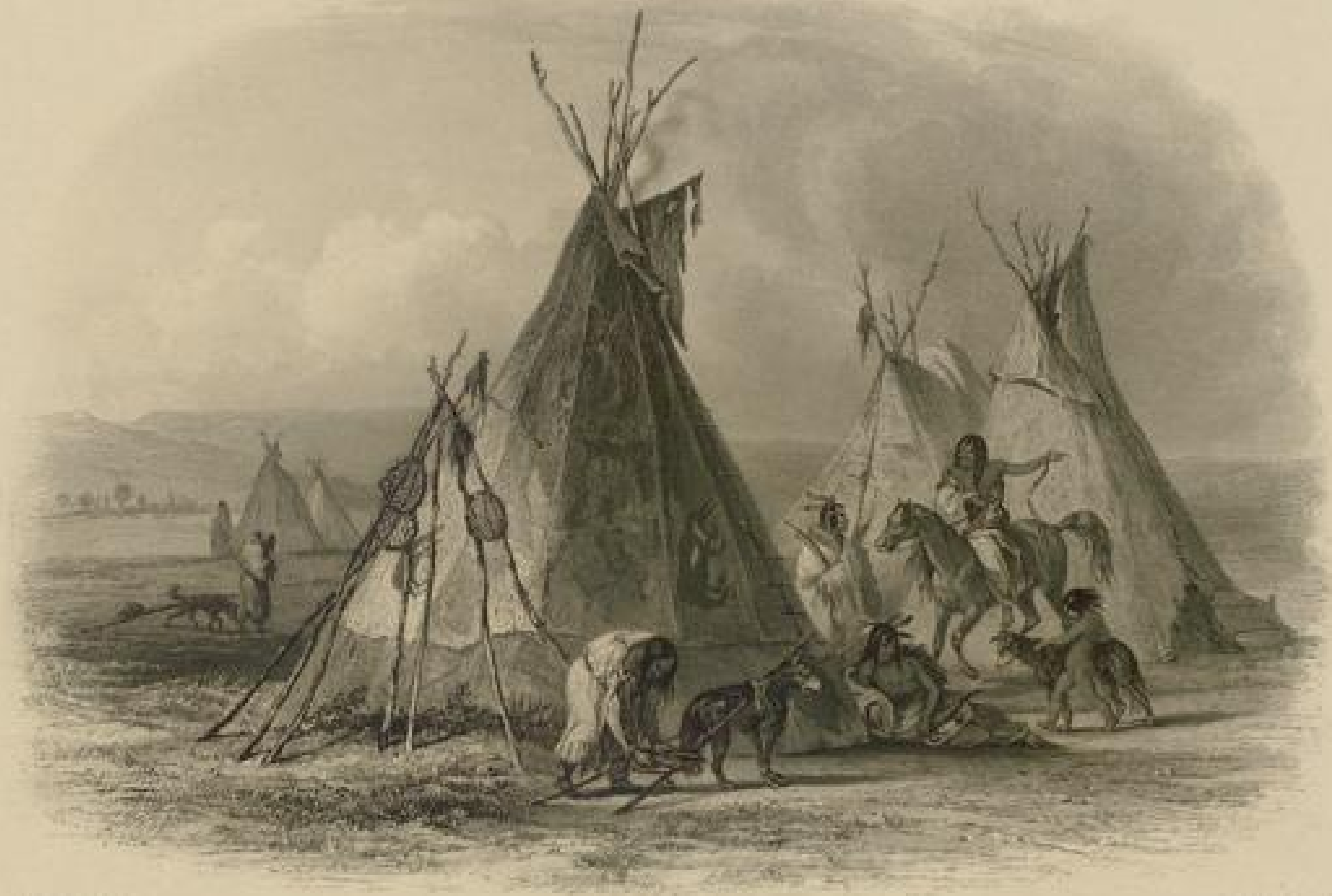
LEDSERREIT KINES ASSINIBOIN CHEFS. | TENTE EN CUIR D'UN CHEF ASSINIBOIN.