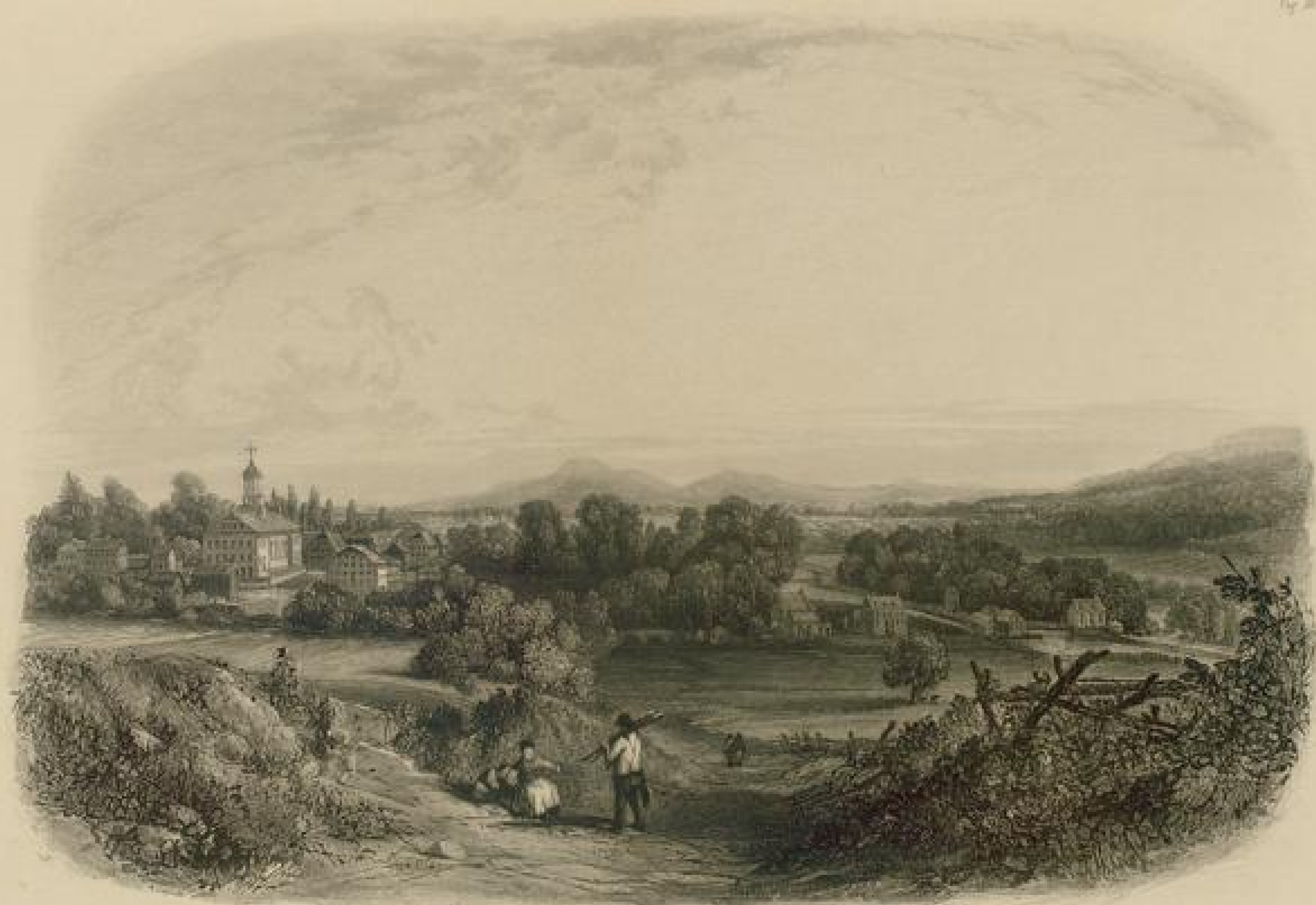
ANSICHT VON BETHLEHEM