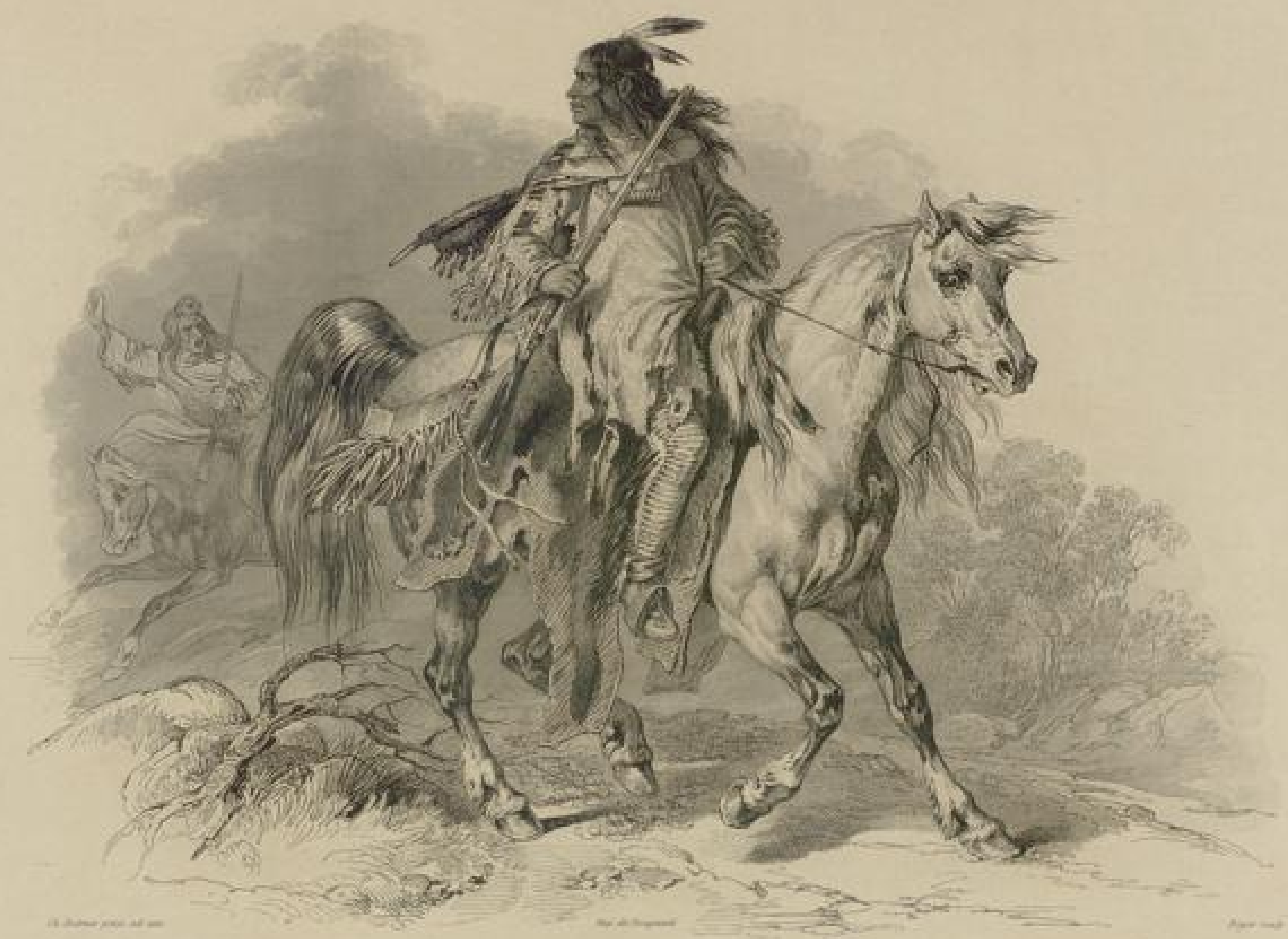
BLACKFOOT INDIANER EU PFERD. | INDIEN PIEDS NOIR A CHEVAL. A BLACKFOOT INDIAN ON HORSE-BACK.