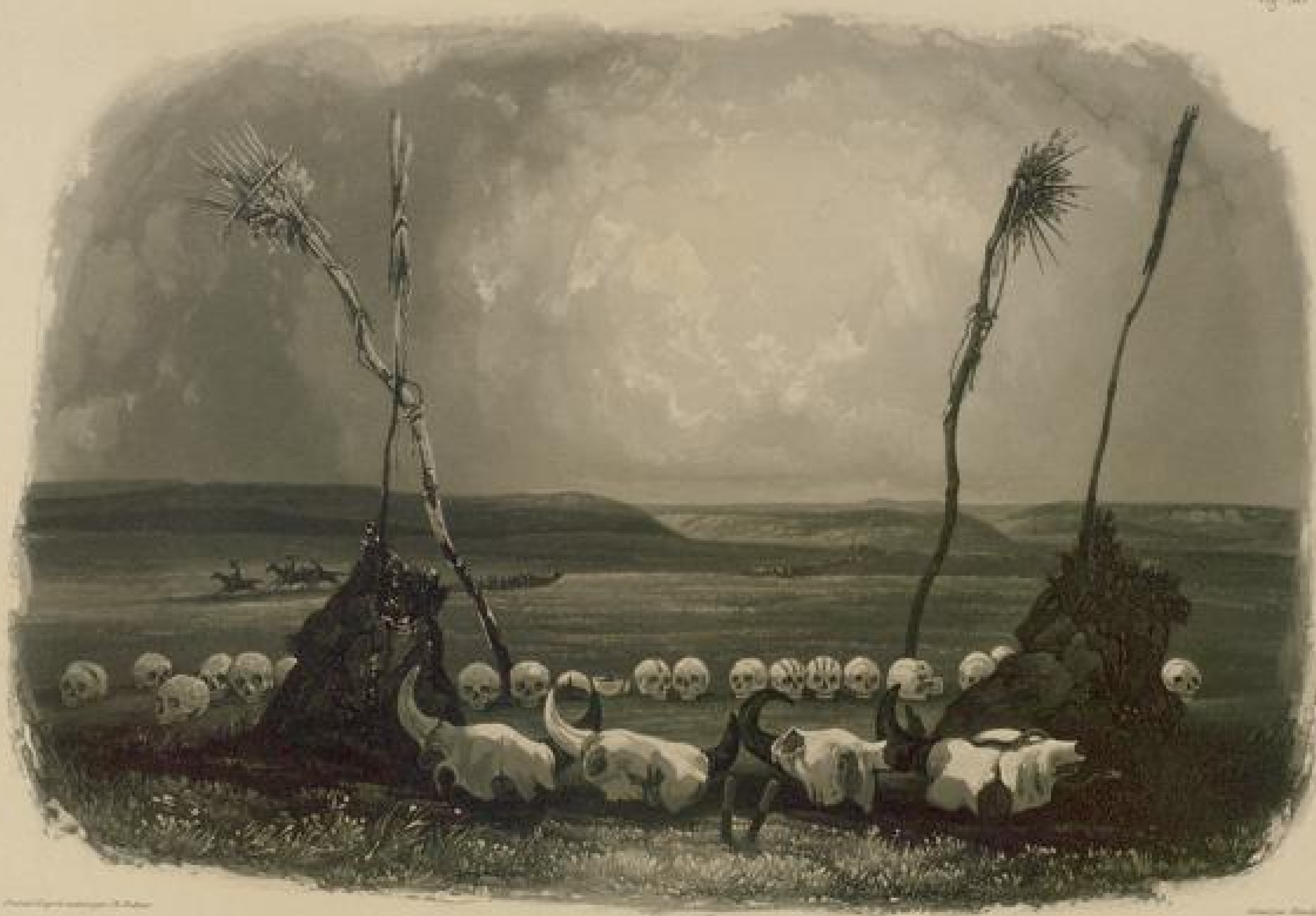
OFFERER DER MANDAN-INDIANER. | OFFRANDE DES INDIENS MANDANS. OFFERING OF THE MANDAN INDIANS