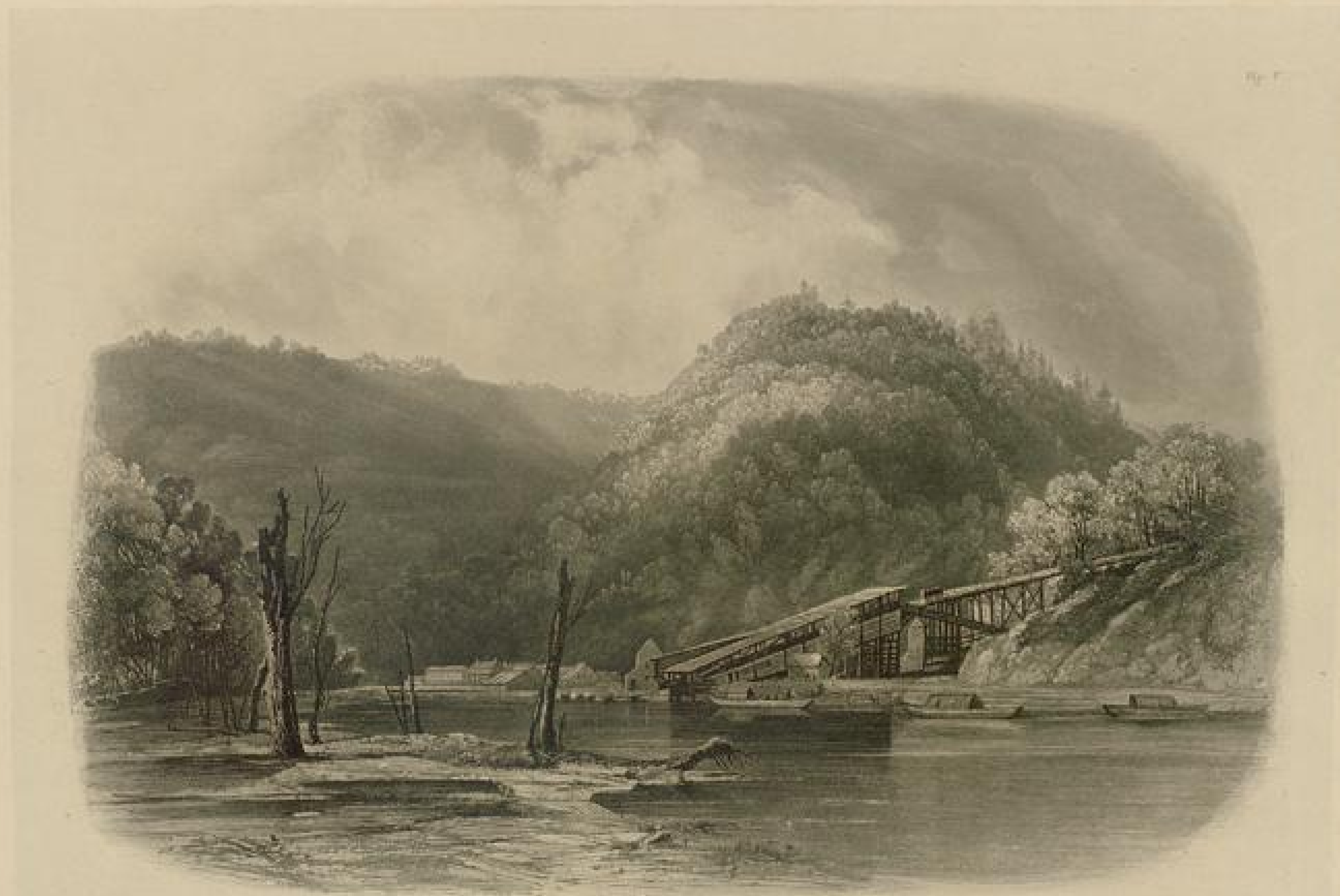
ANSICHT VON HAUCH-CHUNE. VUE DE HAUCH-CHUNE.