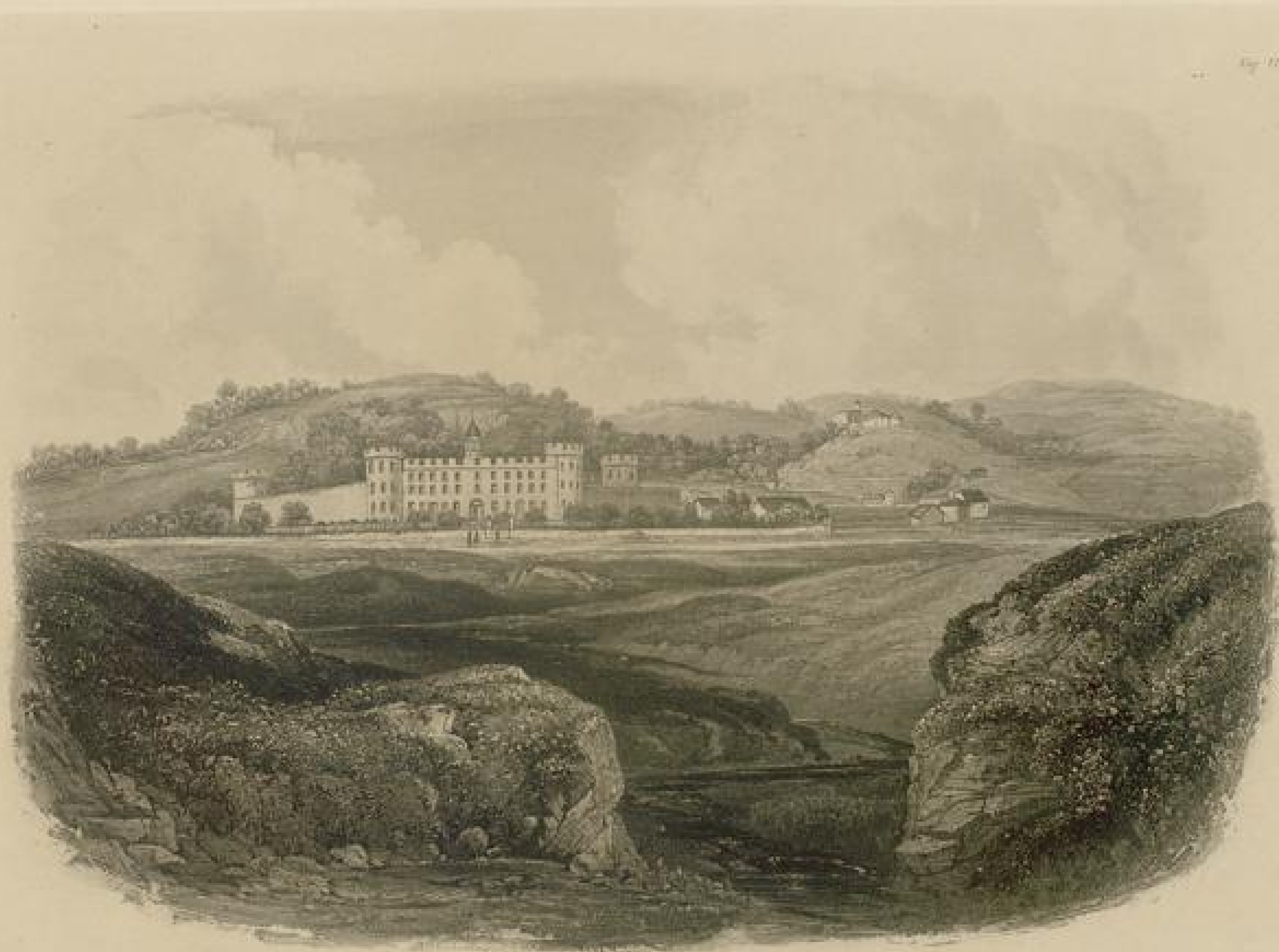
BUCHHAUS - PENITENTIAIRE in Pittsburgh near Pittsburgh PENITENTIARY NEAR PITTSBURGH

Engraving published by American S. T. & Co. New York