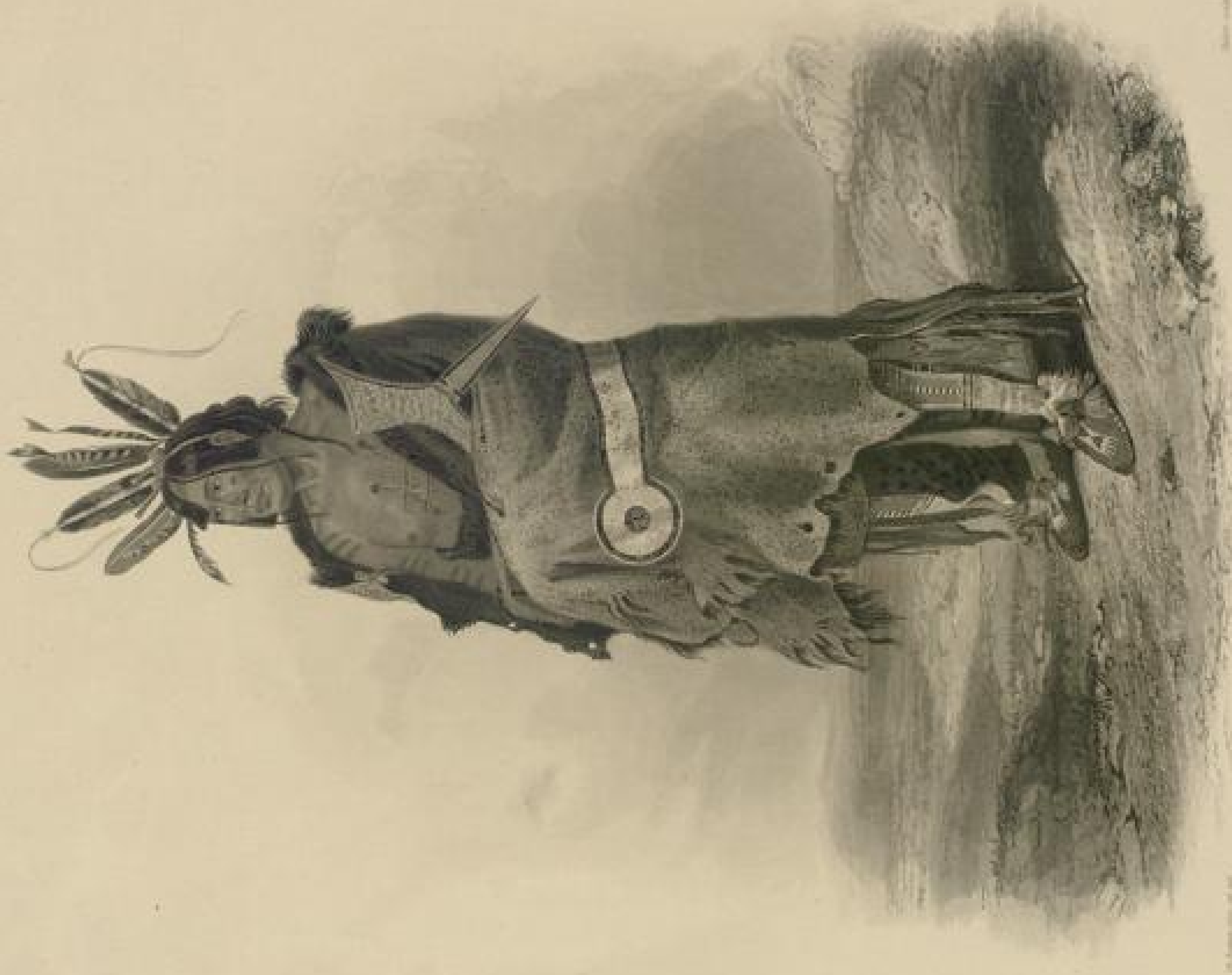
ZACHTŪWA - CHEIXÄ. Mullens, Träger in Indianen - Portraits .