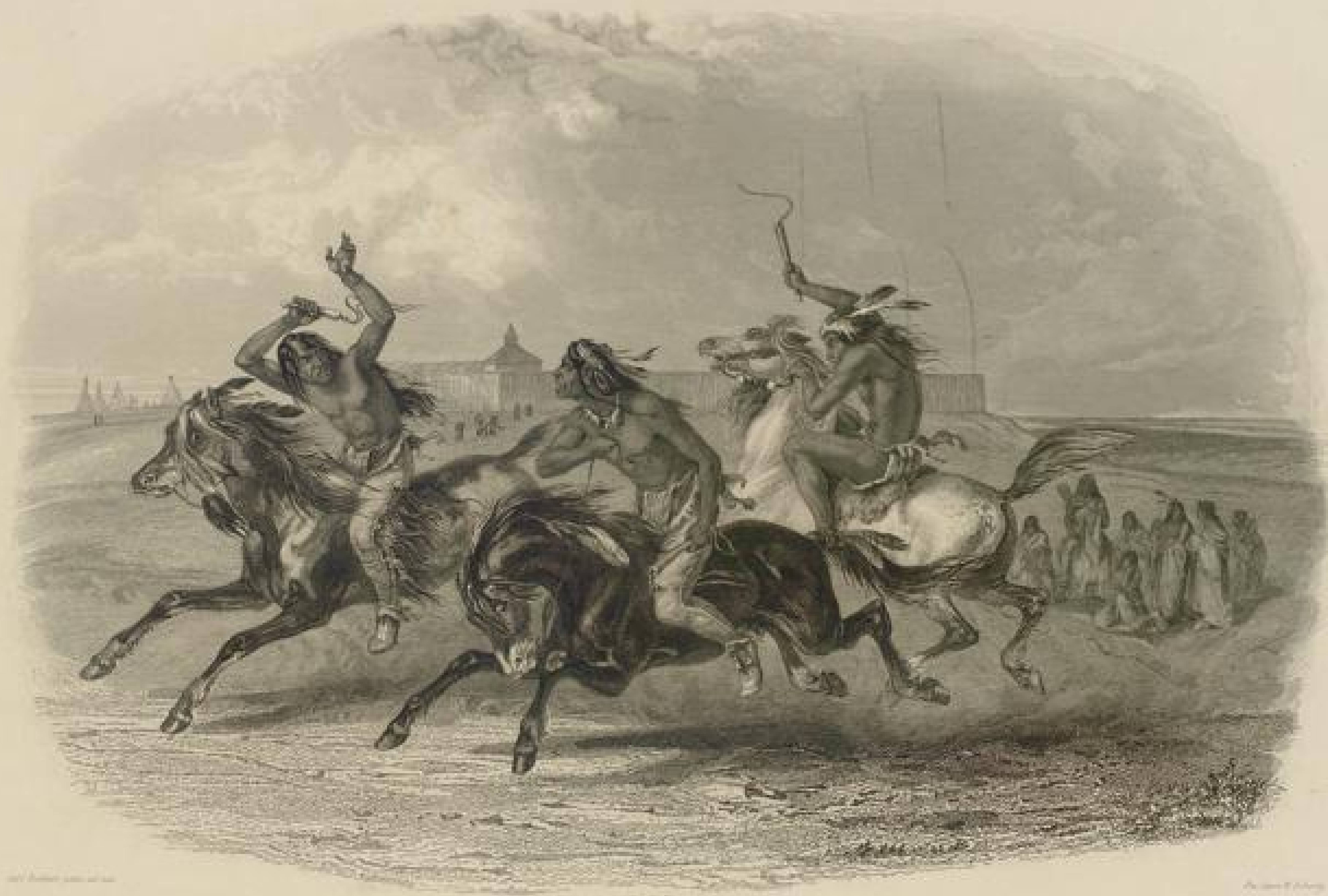
FESEDERENEN DER SIOUX INDIANER