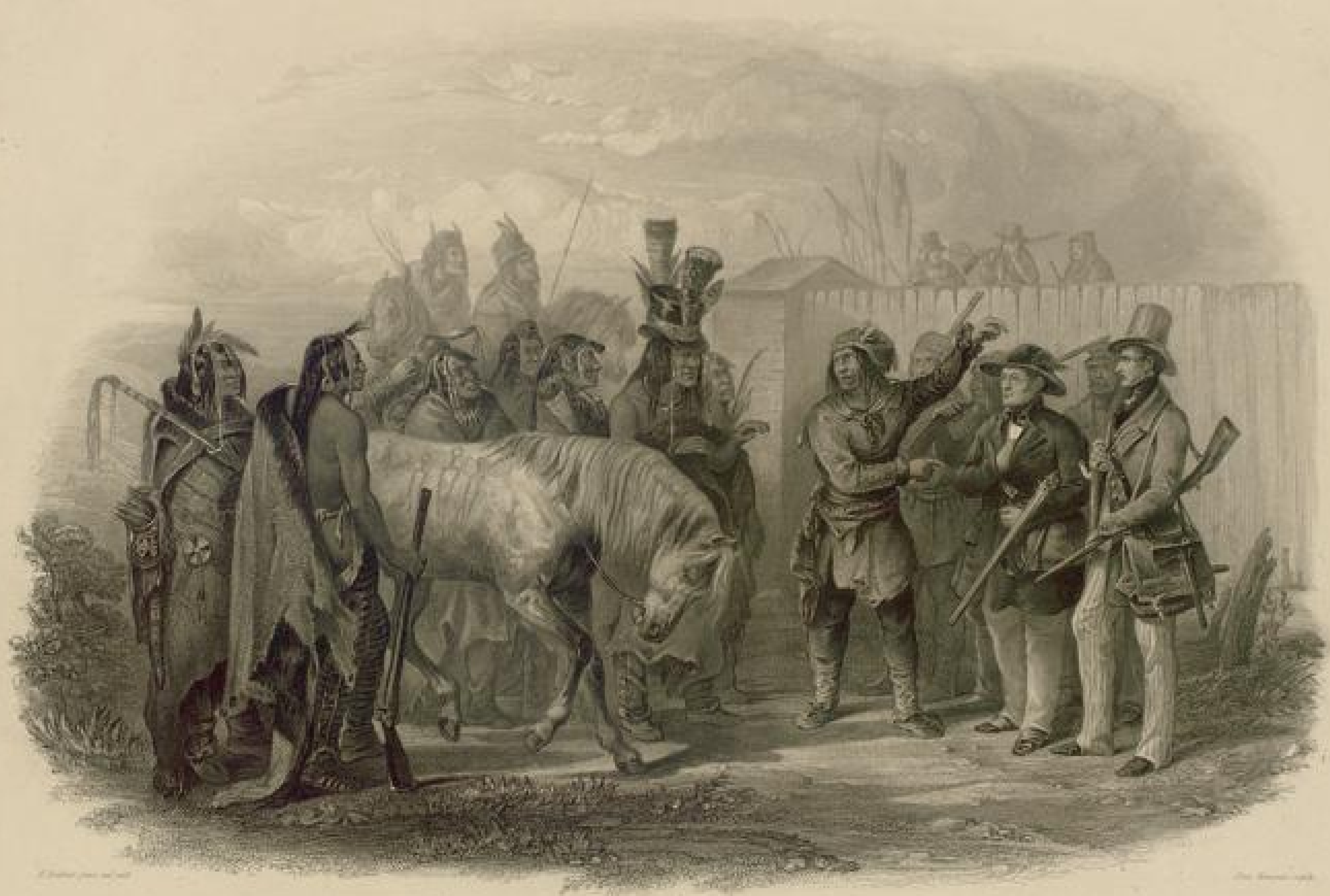
ZUSAMMENKUNFT DER REISENDEN MIT MONTANARI INDIANERN