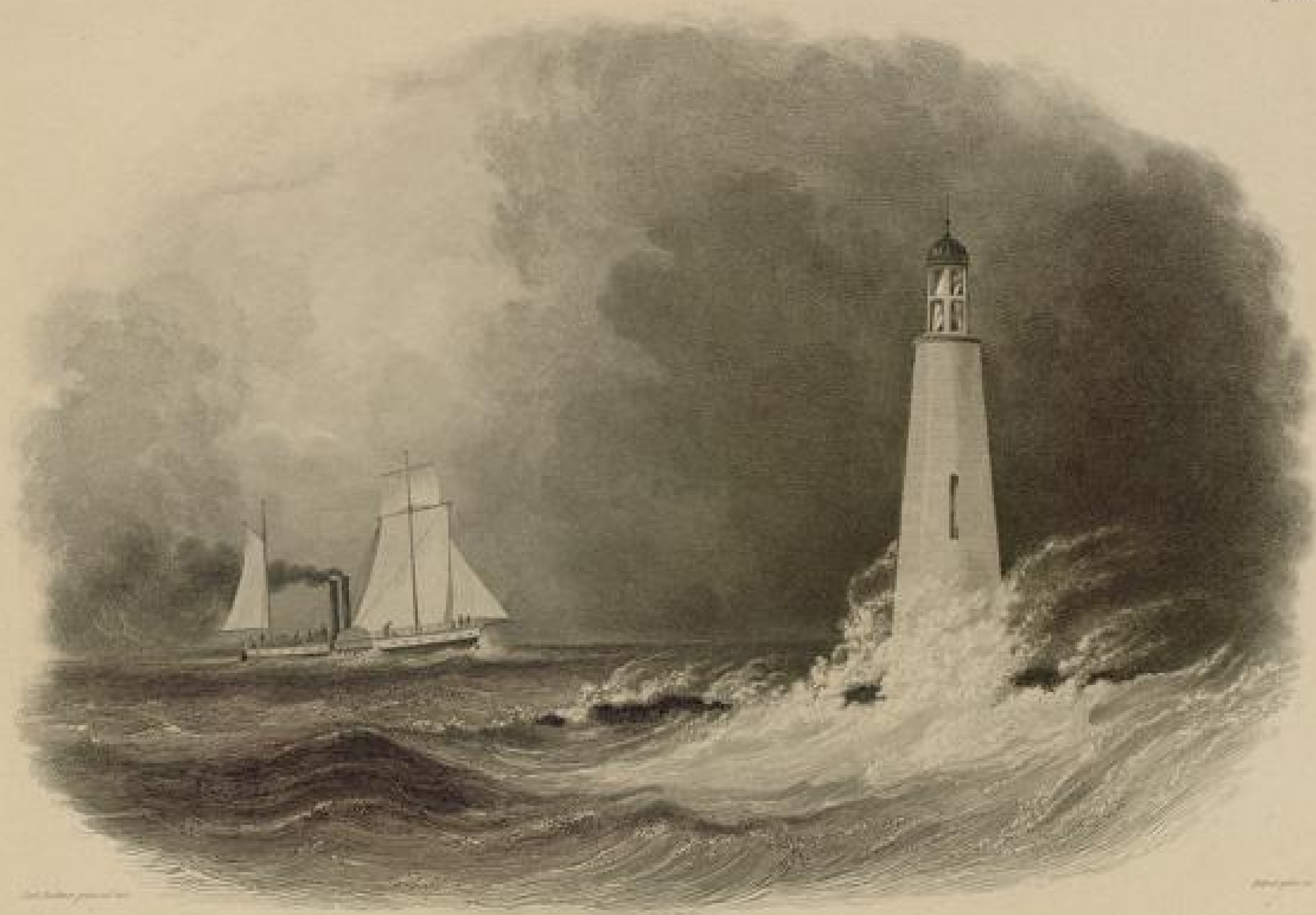
LEUCHTTHURM BEI CLEVELAND