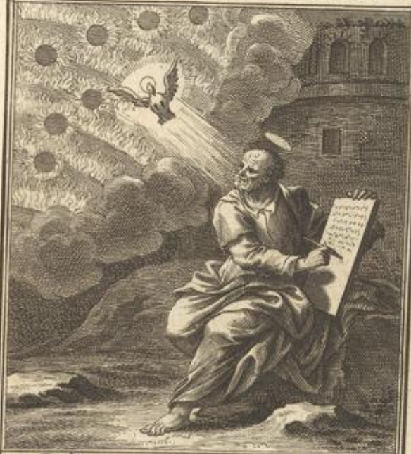
Die andere Epistel St. Petri.