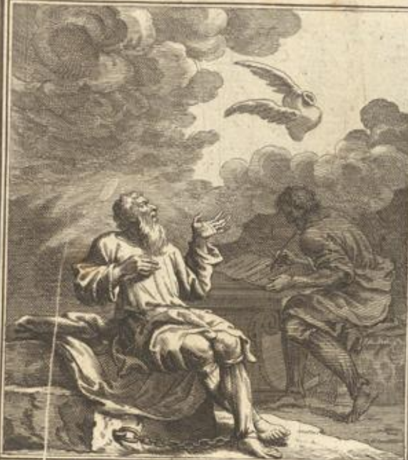
Die Epistel St. Pauli an Philemon.