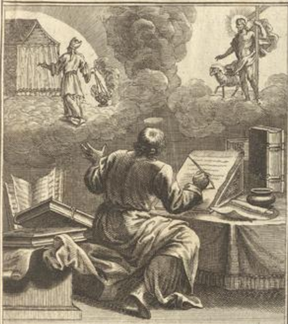
Die Epistel an die Hebräer.