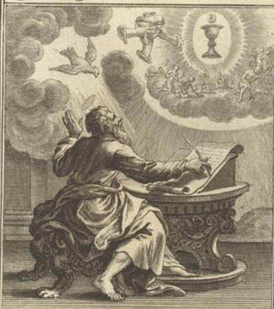
Die erste Epistel St. Pauli an die Corinthier.