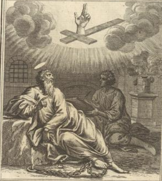
Die Epistel St. Pauli an die Philipper.