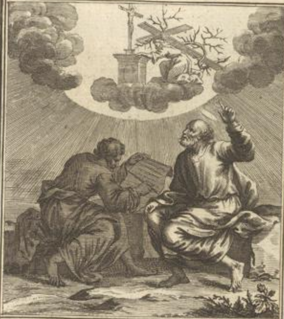
Die erste Epistel St. Petri.