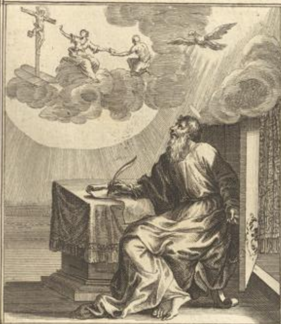
Die Epistel St. Pauli an die Römer.