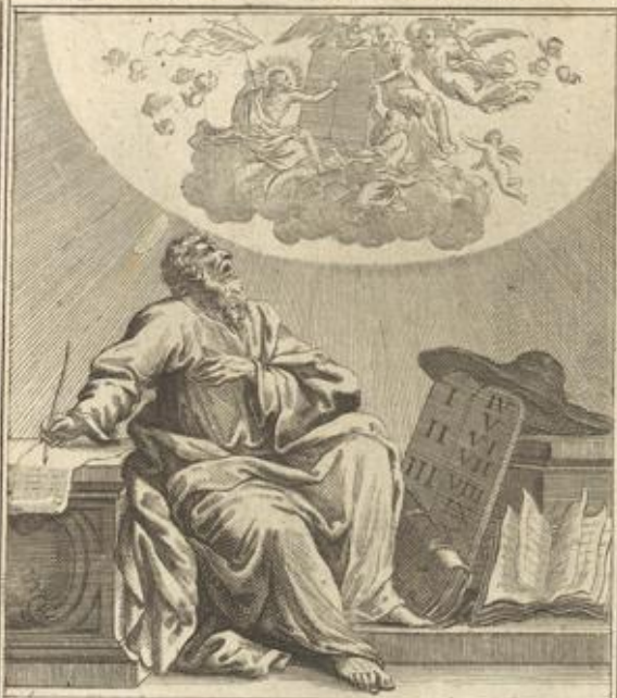
Die Epistel St. Pauli an die Galater.