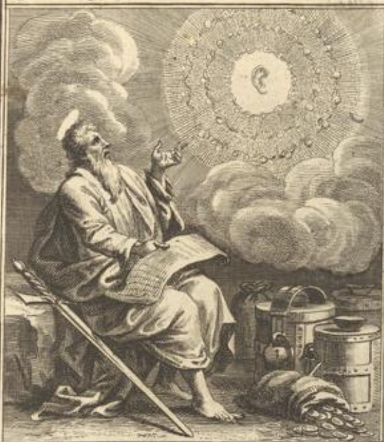
Die ander Epistel St. Pauli an die Corinthier.