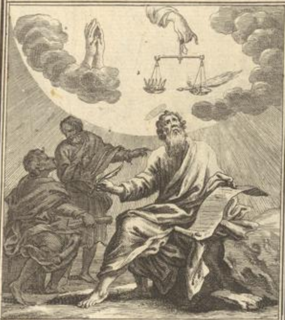
Die Epistel St. Pauli an die Colosser.