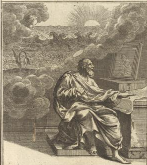
Die Epistel St. Jacobi.