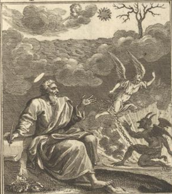
Die Epistel St. Juda.