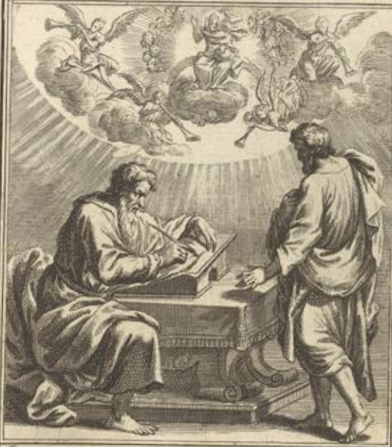
Die erste Epistel St. Pauli an die Thesalonicer.