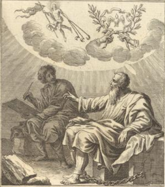
Die Epistel St. Pauli an die Epheser.