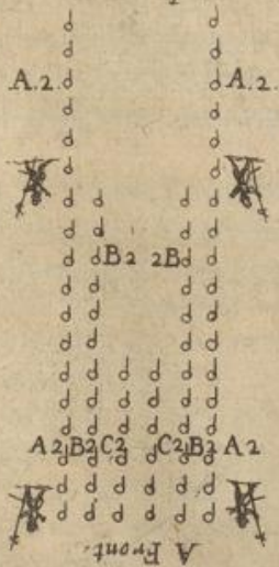
Fig: 1. par. 2. Cap: 3.