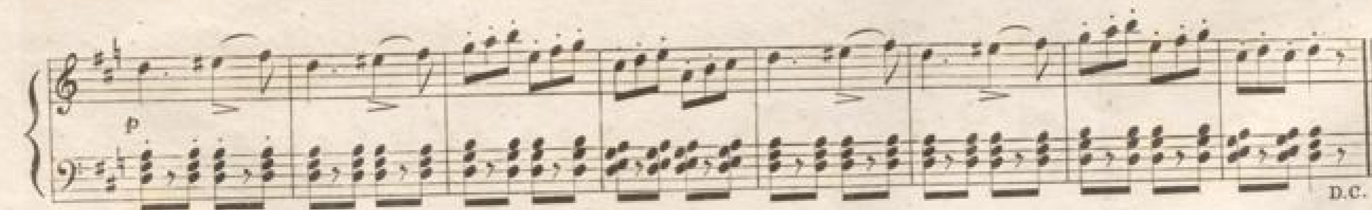
FIGURE de la POULE.

Un cavalier traverse en donnant la main droite à la dame de vis-à-vis, retraverse en donnant la main gauche, balancer quatre en ligne sans quitter les mains, demi-promenade, en avant deux et en arrière, dos-à-dos en avant quatre, chaîne anglaise.